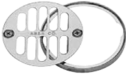
Image: Grate with Crown