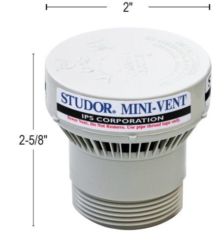
⊢Adaptor 1-1/2" NPT-

NSF Standard 14— Plastics Piping System and Components