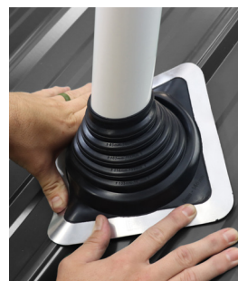
5. Form the flashing