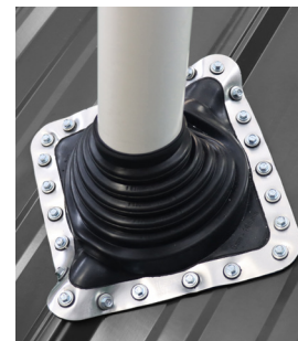
10. Inspect the installation