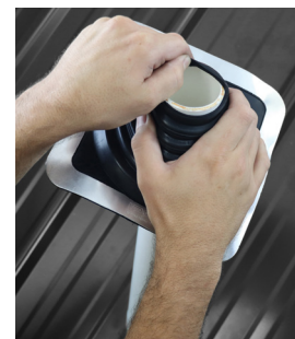
4. Place the flashing over pipe