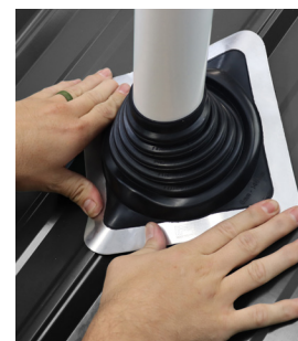
8. Press flashing onto sealant