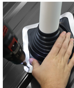
9. Secure flashing with screws