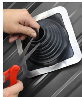
3. Cut the flashing