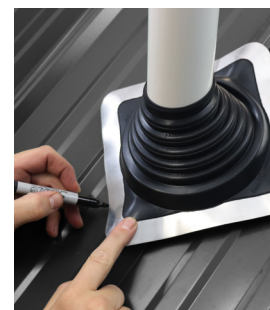
6. Outline the base with marker