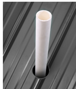
1. Prepare the vent pipe

Improper installation will void the warranty listed at www.ipscorp.com/terms-and-conditions .