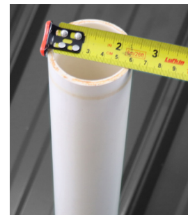
2. Measure pipe diameter